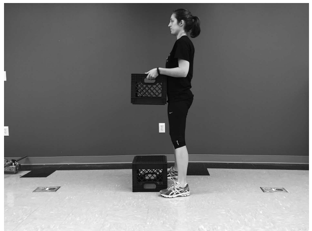
FIGURE 2 Crate lift end position. Used with permission.