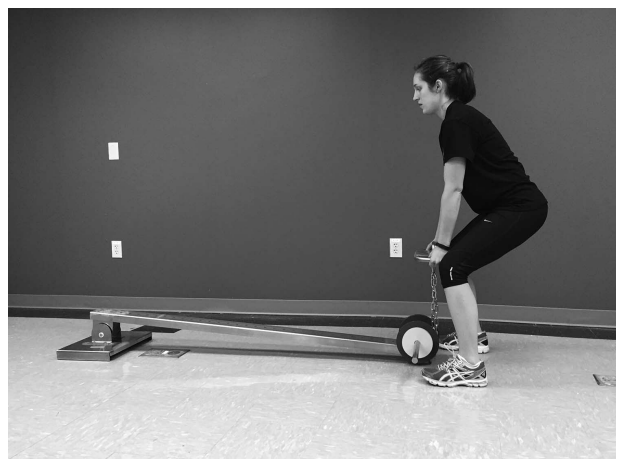
FIGURE 3 XRTS lever arm start position. Used with permission.