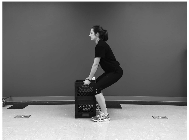
FIGURE 1 Crate lift start position. Used with permission.

The XRTS Lever Arm is a device that has been designed to replicate the biomechanics of the crate lift and is used to measure the maximal amount of weight a client can lift (St. James et al., 2010). Clinicians are using this device in clinics across the country and have found this tool to be useful in documenting objective progress in FCEs. Researchers and clinicians have developed a specific protocol to evaluate sincere effort using unmarked weights to add to a traditional 2.5-lb crate that is 12 in. × 12 in. × 10½ in. (see Figures 1 and 2) and the XRTS Lever Arm (see Figures 3 and 4). For the purpose of this study and performing the testing clinically, public knowledge to identify the value of each weight added to the crate or lever arm would diminish the accuracy and defeat the purpose of the test. The act of attempting to estimate the workload being lifted would add an element of dual tasking for the participant, which may increase the likelihood of failing established validity criteria. The identification of the absolute value of each weight is proprietary information to the owners of the testing system. Each weight used in this study was calibrated for accuracy. A