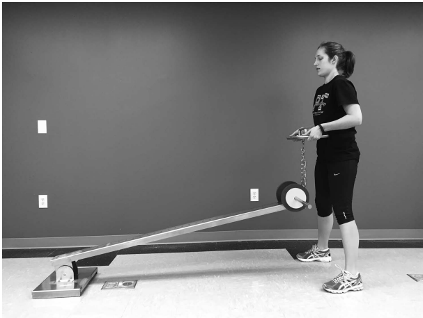
FIGURE 4 XRTS lever arm end position. Used with permission.

10-point modified RPE scale specific to this study (see Table 1) was also used to determine perceived exertion with each lift attempt.